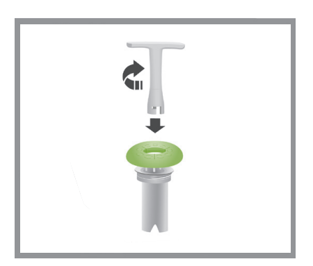
Remove HPKV from packaging and, with a slight counter clockwise twist, plug they Service-Key into the new HPKV cartridge.