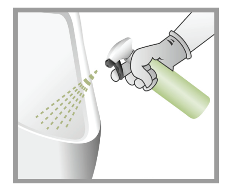
Activate the new HPKV by flushing about 5 liters of soapy water. Spray urinal with pH neutral cleaner*. Do NOT wipe afterwards.

NOTE: For this cleaning use a concentrated acid cleaner.