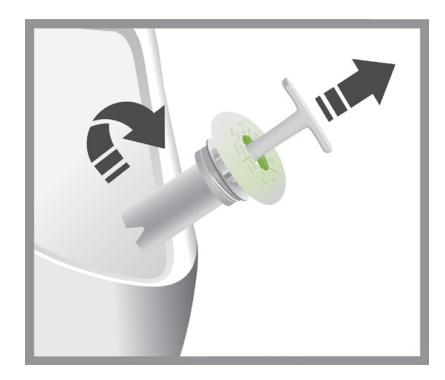
Place the Service- Key into the High Performance Key-Valve (HPKV) and turn counter clockwise to unscrew the HPKV from the Key-Adapter